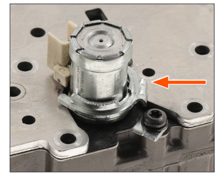
Factory bracket commonly broken

Reinforces the weak factory mounting tab (known for breaking in stock applications) causing various issues of delayed or no move forward, TCC slip, limp mode, vent leaking, low pressure codes and burnt UD clutches.